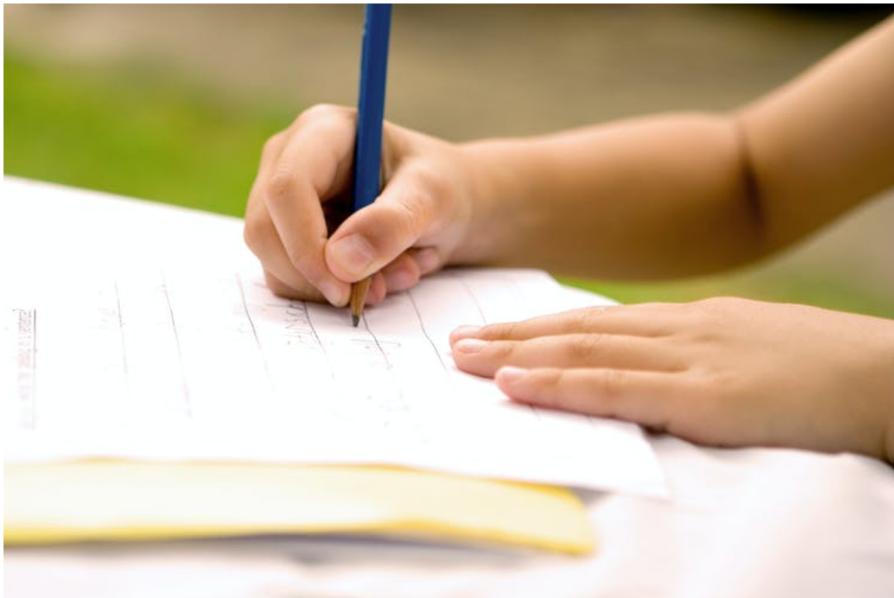
Teachers in the early years of school seem to spend the most time explicitly teaching kids to write.

Research also suggests explicitly teaching writing strategies such as planning, drafting and revising is a particularly effective method for improving writing skills of all students.